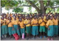
Village school with 900 students

We had the opportunity to minister to over 1,028 people, gave out 1,745 prescriptions and saw 668 people put their faith in Christ. Praise the Lord for His faithfulness!!