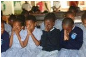
Children at Word of Life School